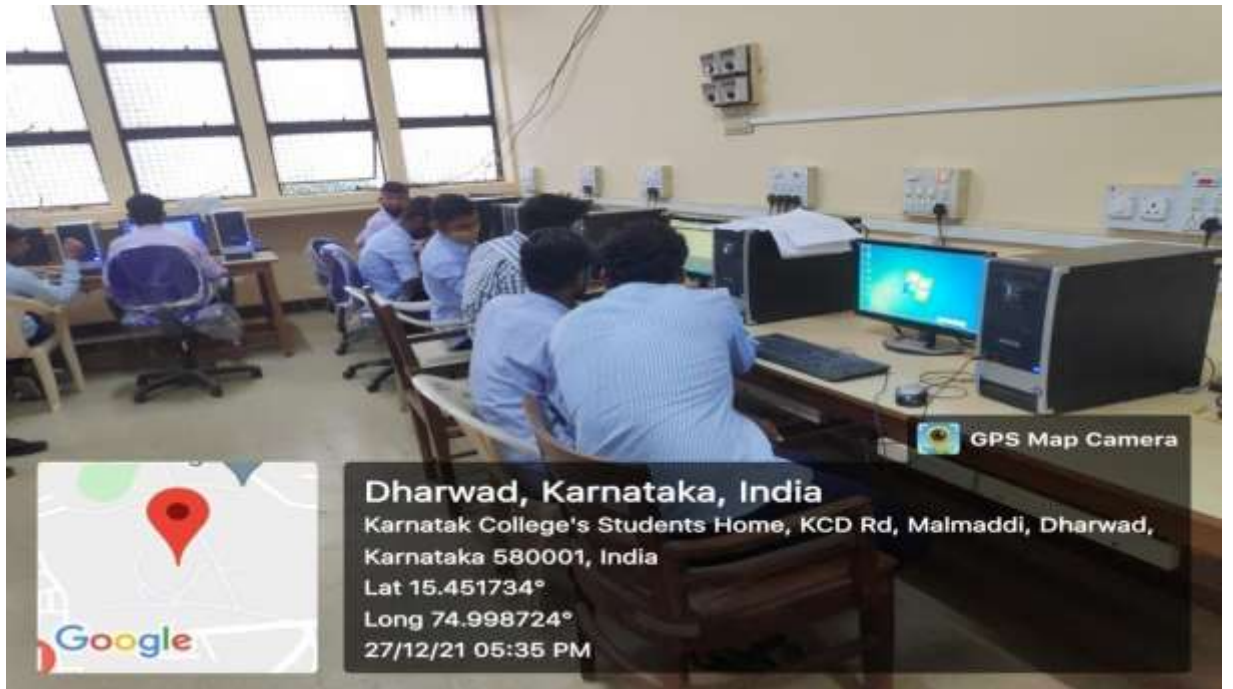
Students browsing e-content from INFLIBNET